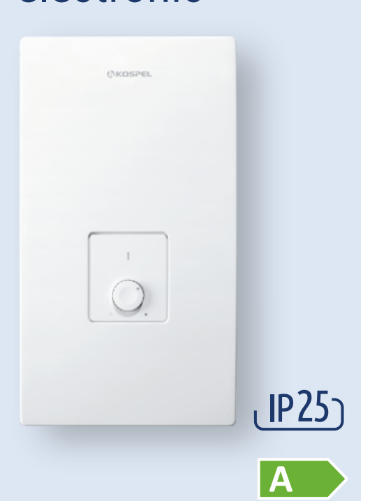
Electronically controlled heater.